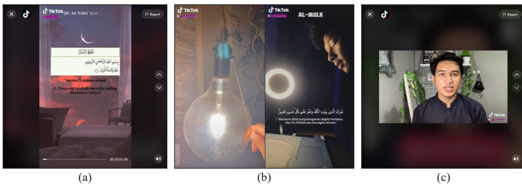
Figure 2. Visualization of al-Qur'an on TikTok: (a) SD1 model; (b) SD3 model; and (c) Sd4 model

Sub-theme 1: Providing Information on Ways to Read the Qur'an. The ways to read the Qur'an emphasize the rules of tajwid (the science of reading the Koran), such as makharij al-huruf (pronouncing letters) (SD5; SD6), reading law (SD5), waqaf (stop) signs (SD4), and analyzing the beginning of a letter ( al-ahruf al-muqatta'ah ) (SD3).